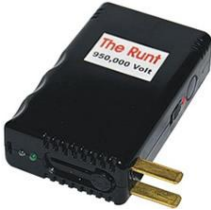
The Runt 950,000 volt Rechargeable Stun Gun

A FREE report brought to you by TBO-TECH Self Defense Products